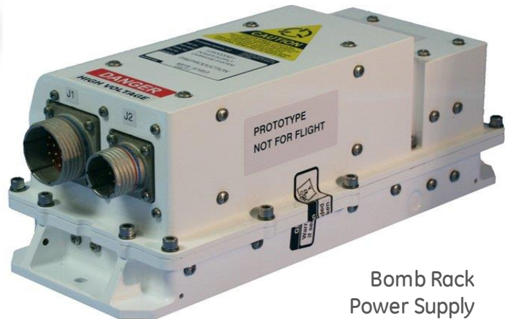
Bomb Rack Power Supply